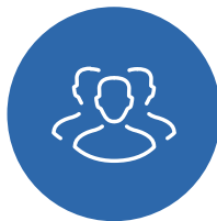
Dedicated Marketing Expert